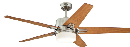
Reversible Maple Finish Blades